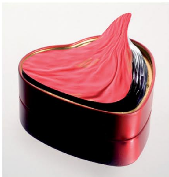
Cushion pad for chocolates by Eurocartex.

Cushion pads for chocolates, biscuits and cookies boxes are soft, flexible and ecological. They are made of embossed paper (from 2 to 9 layers) with padding effect, soft T7 (from 2 to 12 mm) or resistant T3 (from 1,5 to 9 mm). The cushion pad has the mechanical function of protection against shocks and pressures inside boxes, and acts as a stabilizer during transport. Ideal for food security, it enhances and optimizes the storage of products. "Furthermore, it's a great advertising medium – they say –: we can enhance your image with various formats or fantasy images register cuts, offering the possibility of centered patterns and advertising insertions with prints up to 7 colors. It is recyclable and 100% biodegradable". www.eurocartex.it